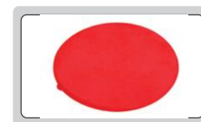
polishing cloth (included)