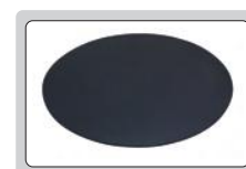
magnetic pad (included)