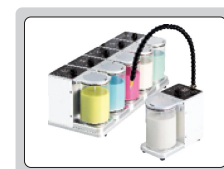
automatic liquid dropper (optional)